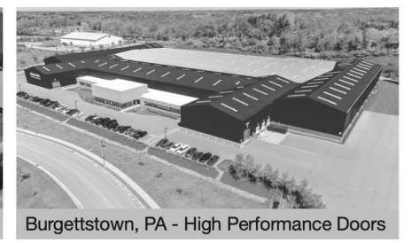
manufacturers of doors we're committed to providing the best quality, value, and selection. Whether residential, commercial or industrial, we have the door you're looking for. Each Hörmann product gives you the perfect array of benefits and options to satisfy your customers.