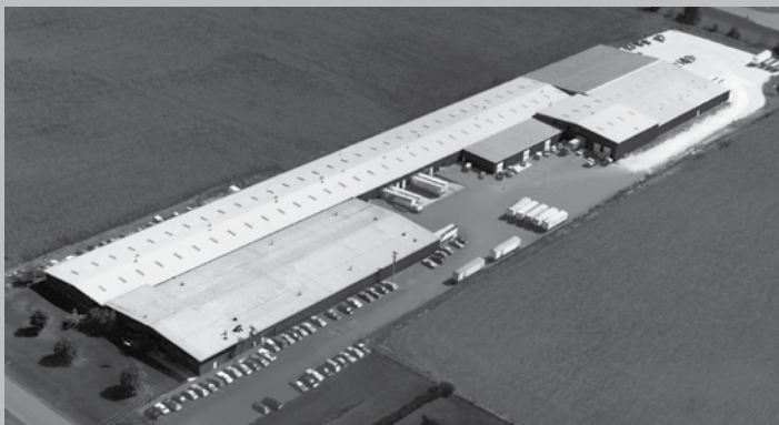
Hörmann LLC, Montgomery, IL

whether traditional or contemporary, we have the door you're looking for. Each Hörmann door gives you the perfect array of benefits and options, with the drive to match.