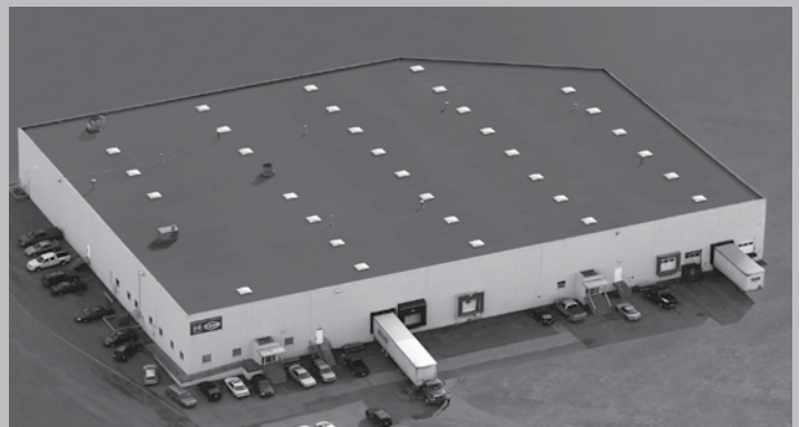
Hörmann Flexon LLC, Leetsdale, PA

For assistance and service call 1-877-OK-HORMANN (1-877-654-6762)